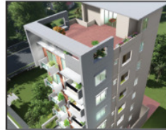
" FAIR FACE PRANTIK " PLOT-11, ROAD-7, SECTOR-11, UTTARA, DHAKA-1230.