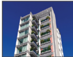
" FAIR FACE A.B RESIDENCY " PLOT-14, ROAD-12, SECTOR-03, UTTARA, DHAKA-1230.