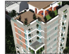
" FAIR FACE ALTAF MANSION " PLOT- 02, ROAD-02/A, SECTOR-16/F (DIABARI), UTTARA,