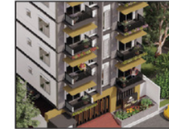
" FAIR FACE SPRING FIELD " PLOT-15, ROAD-6/B, SECTOR-12, UTTARA, DHAKA-1230.