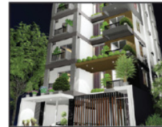
" FAIR FACE LAKEVIEW " PLOT- 32, ROAD-07, SECTOR-15/D, UTTARA, DHAKA-1230.