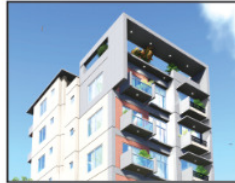
" FAIR FACE ROUSHAN SERENITY " PLOT-35, ROAD-18, SECTOR-11, UTTARA, DHAKA-1230.