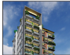
" FAIR FACE GREEN HERITAGE " PLOT-54, ROAD-18, SECTOR-03, UTTARA, DHAKA-1230.