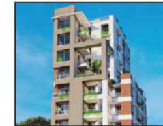
" FAIR FACE SOUTH POINT "- PLOT-42, ROAD-05, SECTOR-10, UTTARA, DHAKA-1230.

" FAIR FACE AFNA LODGE"- PLOT # 06, ROAD-15, SECTOR-06, UTTARA, DHAKA-1230. " FAIR FACE WAHID VILLA"- PLOT-28, ROAD-05/A, SECTOR-05, UTTARA, DHAKA-1230. " FAIR FACE SPRING MEADOWS"- PLOT-01, ROAD-02, SECTOR-15/I, UTTARA, DHAKA-1230. " FAIR FACE SUN SHINE "- PLOT-02/04, ROAD-08, SECTOR-15/D, UTTARA, DHAKA-1230. " FAIR FACE KHANIKA"-PLOT-07, ROAD-2/B, SECTOR-15/I, UTTARA, DHAKA-1230.