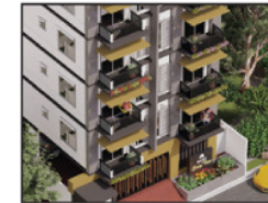
* FAIR FACE SPRING FIELD" PLOT-15, ROAD-6/B, SECTOR-12, UTTARA, DHAKA-1230.