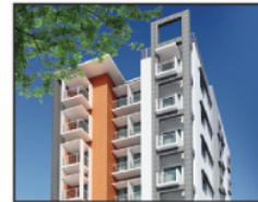
* FAIR FACE SOUTH VALLEY" PLOT- 04, ROAD-12/A, SECTOR-10, UTTARA, DHAKA-1230.