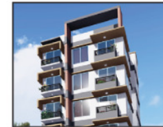
* FAIR FACE SOUTH CASTLE" PLOT-34, ROAD-15, SECTOR-12, UTTARA, DHAKA-1230.