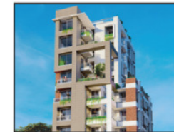
* FAIR FACE SOUTH POINT" PLOT-42, ROAD-05, SECTOR-10, UTTARA, DHAKA-1230.